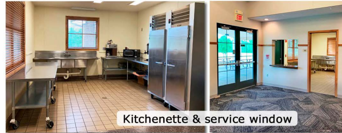
Kitchenette & service window