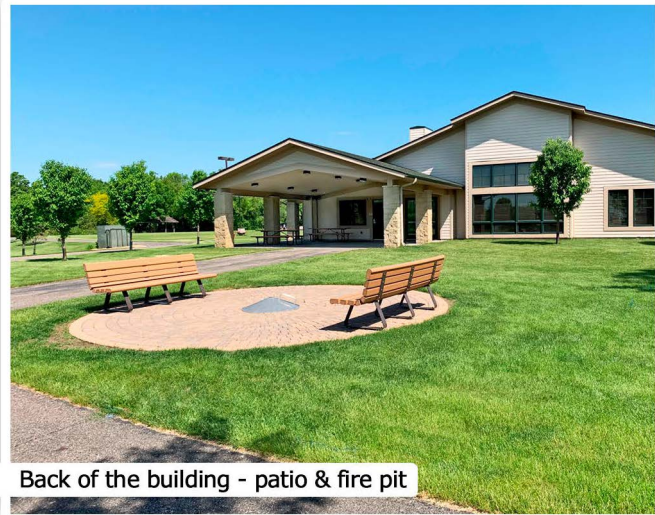
Back of the building - patio & fire pit

Mailing Address: 2052 County Road 24 Medina, MN 55340