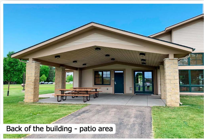
Back of the building - patio area

The Hamel Community Building is owned by the City of Medina, and is operated through an agreement with the Hamel Lions Club.