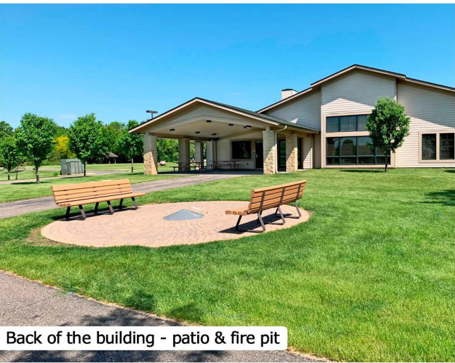
Back of the building - patio & fire pit

Mailing Address: 2052 County Road 24 Medina, MN 55340