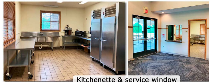
Kitchenette & service window