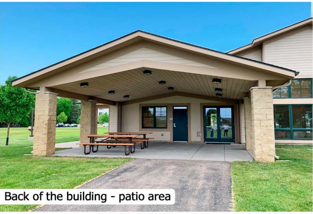
Back of the building - patio area

The Hamel Community Building is owned by the City of Medina, and is operated through an agreement with the Hamel Lions Club.