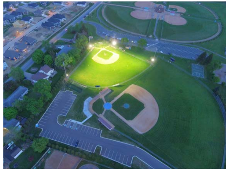
Above: New Musco LED Total Light Control fixtures lighting up the Little League Field in Hamel Legion Park on May 17, 2018 with no light spilling onto nearby properties.

The City of Medina has been working in partnership with the Hamel Athletic Club to address safety concerns on the City's aging Little League baseball field in Hamel Legion Park. The aging field did not meet Little League International's regulations for safety for insurance purposes and to host tournaments. The City of Medina collaborated with the Hamel Athletic Club late last fall to apply for a grant from the Twins Community Fund, which we were successfully awarded $45,000 to help us address our safety needs. This grant money along with a $60,000 donation from the Hamel Athletic Club is what the City needed to complete the installation of new lights and other field improvements. The old lights were over 30 years old and no longer functioning properly, creating a potential electrical hazard. The new Musco LED Total Light Control fixtures provide tight control of unwanted spill and glare light and save on energy use and costs. The tight cut-off control of unwanted spill and glare light makes the lights environmentally friendly to nearby residential areas.