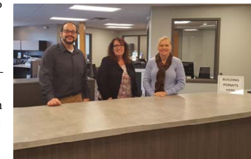
Above: Planning staff behind new lower-level counter.

Medina City Hall will remain at 2052 County Road 24, but residents might have to enter a different door, depending on which department you are coming to see. The basement of City Hall that has sat empty for the past two years, since the Police Department moved to 600 Clydesdale Trail, is now the Planning, Zoning and Building Department. If you are coming to City Hall to discuss your property, inquire about land-use, or apply for a building permit, follow the signs around the building to park and enter on the lower-level. The newly remodeled lower-level features a new conference room right off the entry way, along with an expanded front counter for staff to be able to better serve the needs of residents and contractors while looking at plans.