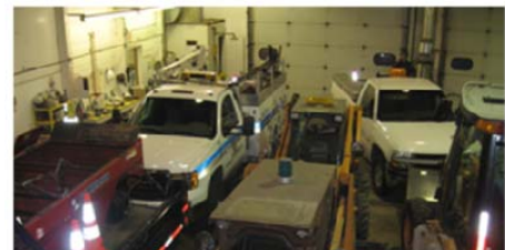
Current Public Works Facility