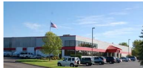
Existing Clam Corp Building at 600 Clydesdale Trail

These conditions continue to exist and become more aggravated as the current structure attempts to serve the present needs of the growing City. The City's Capital Improvement Plan has since 2004 identified the need for new public works and police facilities. Recognizing the serious nature of the problem, in 2011 the City negotiated an option to purchase 11 acres from Hennepin County at their Medina maintenance facility to construct a new public works building at an estimated cost, land and building, of $185.71 per square foot.