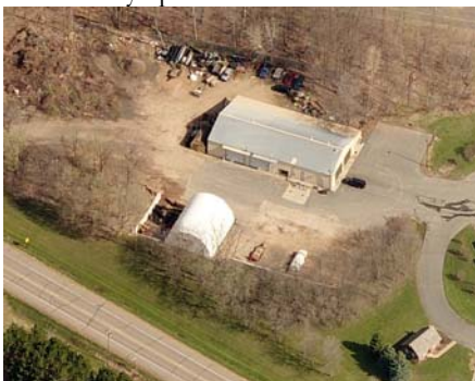
Existing Public Works Facility Site

In 2007 a consulting architect made some of the same points as the 1990 study and concluded that the present building is obsolete because the OSHA requirements are not met, inadequate ventilation exists and the storage space poses a hazard to users. The 2007 study also detailed inadequacies of the police facilities and, in summary, recommended construction over time of in excess of $12 million in 2007 dollars to address these issues and other City space needs.