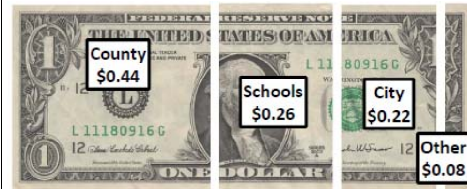
*2017 Property tax breakdown per dollar for Medina Residents in the Wayzata School District

The City Council will also be considering a resolution to approve the preliminary tax levy during the regular Council meeting that begins at 7:00 p.m. The City is required to certify the preliminary tax levy to Hennepin County by September 30th.