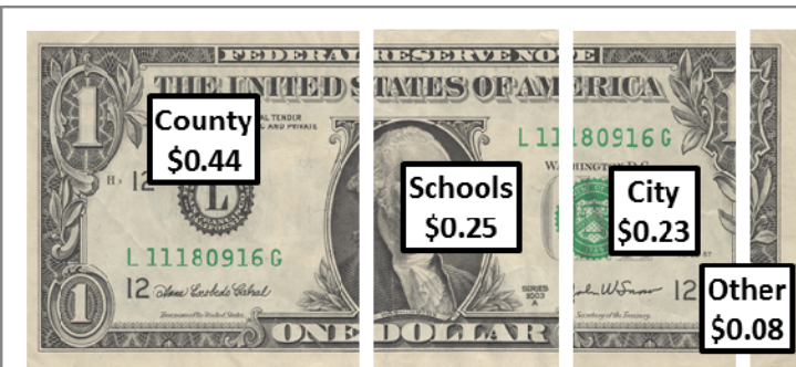
*2016 Property Tax Breakdown per Dollar for Medina

The City is required to certify the preliminary tax levy to Hennepin County by September 15th.